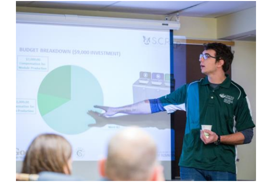
EcoChallenge to Sustainability Project Laboratory