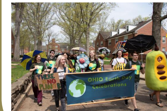
Climate & Sustainability Ambassadors