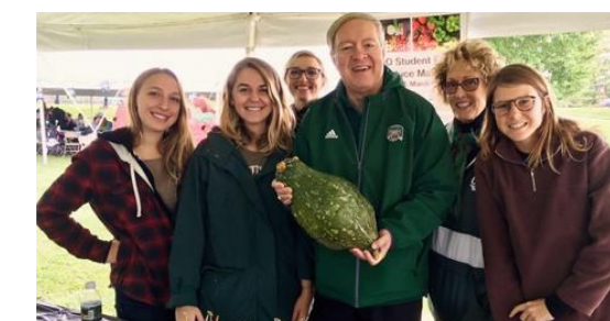
OHIO Student Farm and Farm to OHIO